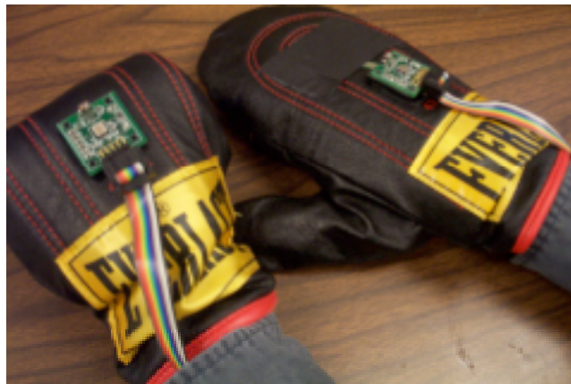
Figure 1: Beat Boxing gloves

Beat Boxing attempts to overcome this barrier by mapping natural percussive movements to the control of electronic instruments and music-based activities. It maps motions such as table drumming, dancing and shadow boxing to control parameters, allowing the musician to move freely and use these rhythms to incorporate their entire body into the composition or performance. The intuitive nature of boxing motions has been explored in a variety of artistic applications, such as the TelephoneBoxing installation [2] and the Soundslam punching bag [3]; however, these are designed as interactive art installations and lack the flexibility for involved performance. A closer musical predecessor can be found in electronic drum pads such as the Yamaha DTX series or electronic drumstick controllers such as the AoBachi [4]. The Beat Boxing gloves build on this intuitive boxing paradigm, interpreting incoming data as a series of “hits” characterized according to power and a number of gestural characteristics. in terms of power, arc of motion, etc.