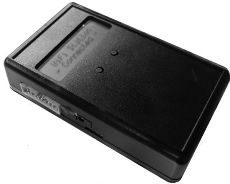
Figure 3 : The WiSe Box LCD prototype

We oriented our choice toward a small Compact Flash WiFi card embedding an Intersil™ compatible firmware. After working out the Compact Flash communication layer, derived from the PCMCIA standard we wrote a custom driver for the WiFi chipset [5] and a UDP stack in a Microchip 18F microcontroller. A 16 bit multiplexed ADC from Burr-Brown™ (ADS8320) and rechargeable batteries were added to the device to turn it into a pocket-sized WiFi sensor to OSC digitizer.