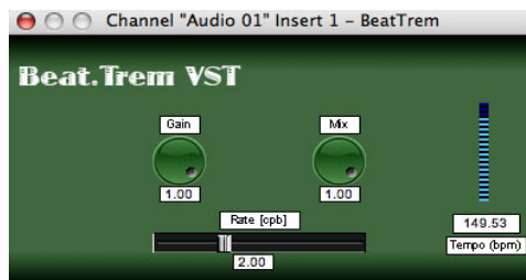
Figure 1: A Beat-Synchronous Tremolo effect implemented as a VST plug-in. The rate is controlled by the number of cycles per beat (CPB).

Currently there exist two possible solutions to these problems. The musician can synchronise the tempo of their performance to an external source, such as a click track, to ensure that the tempo does not vary and hence that the effect stays related to the tempo throughout the piece. This is an undesirable solution as it removes all possibility for tempo