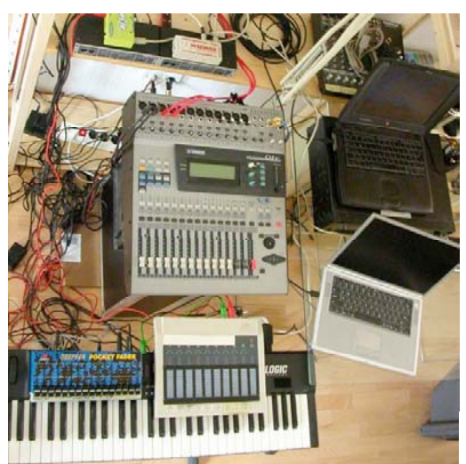
Figure 1. Two laptops, two audio interfaces, a master keyboard, two fader boxes, two MIDI interfaces, a mixer, 8 power supplies, 20+ cables

I would like to start this discussion with a picture of a typical stage setup.