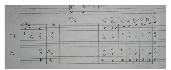
Figure 5: Example of one type of Tooka song notation

The musicians began looking for expressive ways to shape the sounds at about the time that they memorized their first scale pattern. They discovered how to create dynamics by adjusting the pressure inside the tube. A lower pressure creates a softer sound; a higher pressure creates more intensity. In this way, the two musicians can collaborate on note and phrase shape; however, they must be able to agree on the desired shape and intensity for the sound. The musicians use notation (such as shown in Figure 5) and discussion, and real time awareness and gesture to communicate these intensions. One drawback of