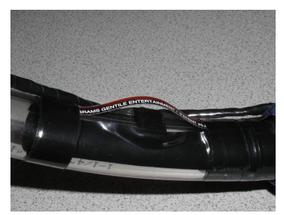
Figure 3: Tooka's Bend Sensor

We attached a 4.5" resistive bend sensor to the Tooka so that we could measure the