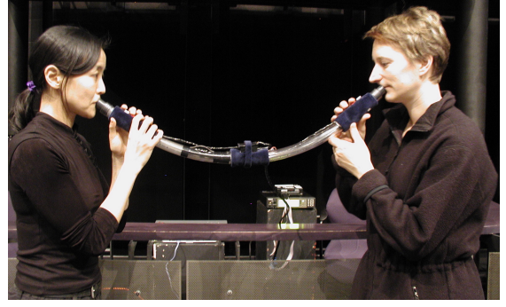
Figure1: Two musicians (authors) playing Tooka.

Tooka continues some of the pioneering work in multi-person musical instruments. Some early explorations in this direction are found in works such as Mikrophonie I and II [10], Laboratorium [4], and groups such as the League of Automatic Music Composers [1] and the Hub, experimental computer network bands [5]. In Mikrophonie I, expert percussionists play a collective instrumented Tam-Tam that has controls for augmenting the sound intended for 2 sets of three players. In