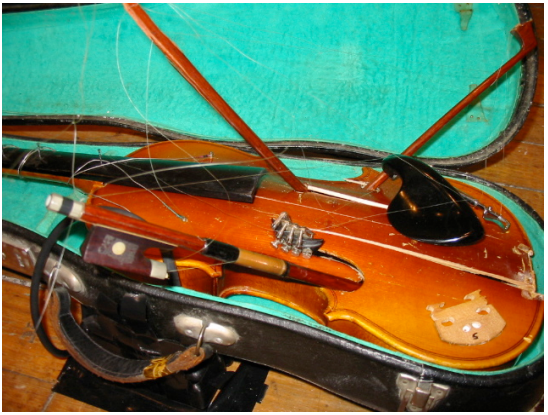
Figure 1. The bow-stab infra-violin.

Atonement for Violin Quartet (by John Bowers, first realisation at the Norwich Gallery, UK, 2004) is a combined installation-performance-webcast work which revisits the instrument destruction preoccupations of the Fluxus artists. Atonement specifically builds upon Nam June Paik's 1962 work One for Violin Solo. In One, a violin is slowly raised above the performer's head and then brought down suddenly upon a table-top. Atonement continues the action by rebuilding the broken violin and, indeed, over four days, repeats this ritual four times to create a quartet of refashioned instruments. The performance of a quartet composition completes the work. Atonement, in our terms, involves the transformation of violins into infra-violins. The broken bodies of the violins are difficult to use for good string tension. Other sonic possibilities have to be sought in the strings: lengthwise scrapings and low-tension thunks for instance. The broken shards present percussive opportunities with perhaps violin bows becoming beaters or scrapers. Figures 1 and 2 depict two different styles of infra-instrument building from fragments of broken violins.