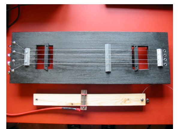
Figure 5. Monochord below a double-ended electric zither .

these effects. In terms of pitch selection, the zither has just eight notes at most. However, this constraint enables other (spectral) possibilities to become the focus of exploration.