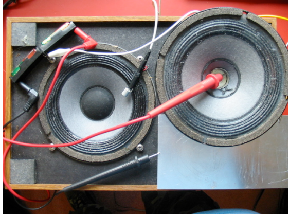
Figure 7. Battery-driven loudspeakers.

Generally, the Victorian synthesizer needs to be electromechanical rather than electronic, manual rather than voltage control is typically required, and some synthesis units will present especial challenges. Oscillators constructed through feeding back the output from amplifiers are, for example, post-Victorian inventions (c.1920 by Barkhausen and Kurz). Accordingly, we make the most of electro-magnetism (an 18<sup>th</sup> century discovery much celebrated by the Victorians) and the minimum of circuitry.