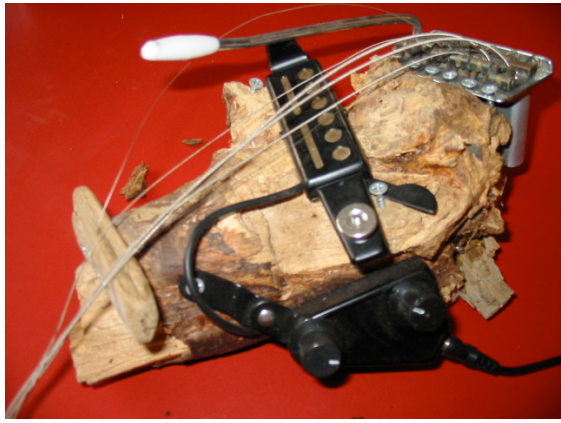
Figure 4. The Strandline guitar (detail).

In contrast to the Strandline and the infra-violins, we have built string instruments with a string tension adequate for coherent pitch. However, other features of the design suggest the infra status of the instruments. In many respects a monochord can be thought of as one of the earliest infrainstruments, the infra-instrument of choice for Pythagoras certainly. The purity of the monochord can be nicely corrupted by the use of a movable bridge pickup to divide the string length in two. While positions for the bridge pickup can be found where Pythagorian ratios obtain between the string segment lengths, we prefer dissonant relationships when a little more 'fuel' is required for live processing and sound transformation. Our four string zither design also has a movable centre bridge but this time we employ pickups at either end. This means we can conventionally amplify the vibrating string segment over the pickup or obtain 'behind the bridge effects' like those associated with Hans Reichel and Glenn Branca's guitar constructions [see 5]. A rewired stereo volume pedal serves as a foot-operated cross-fader to mix