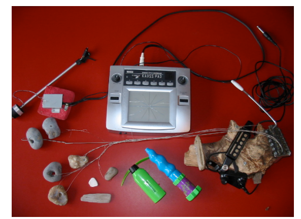
Figure 3. The Strandline guitar (front), The Tone Arm Bandit (record deck tone arm and processing , left and middle, not discussed here).

pebble, and the pebbles left to hang over the edge of a table. Of course, the pebbles provide inadequate weight for a coherent pitch to be heard on plucking. Indeed, furious one handed use of the whammy arm is commonly preferred to plucking, the swinging of the pebbles leading to string tangles, slippages and scrapings against the pickup, all contributing to a characteristic sound when amplified. Spring reverberation can be added to underline the surf guitar inspiration of the design.