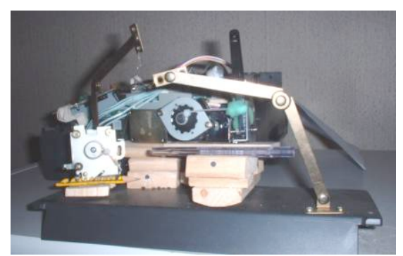
Figure 9. Percussive Printer.

In this example the two primary motors essential to the operation of an inkjet printer (paper feed and print head position) are extracted from the housing and repurposed for musical goals. Divorced from their initial functionality, the motors are built into small mechanical percussion instruments constructed from other writing implements.