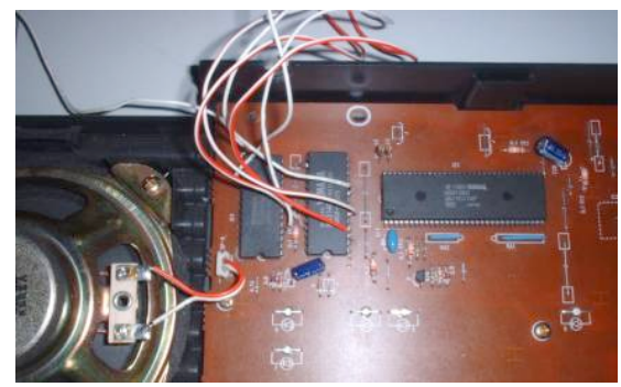
Figure 8. A De-Housed Home Keyboard.

These connections induce tones, bursts of noise and corrupted 'auto-accompaniment' sequences which are unpredictable in their details but generally 'steerable' with practice. The precision afforded by the standard keyboard interface is eschewed in favour of direct contact with the circuit, and the performer is continually forced to rethink and re-evaluate their engagement with the instrument in light of the sonic results.