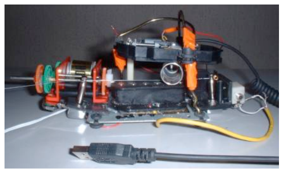
Figure 6. The CD Player Slide Guitar.

Various essential elements from a CD player and an electric guitar are combined to create an instrument with the rich tonal and expressive possibilities of neither. The motor-driven sled, which would typically determine the playback position of a CD, has its laser replaced with a metal 'slide' which governs the pitch of a single guitar string plucked by an electric motor.