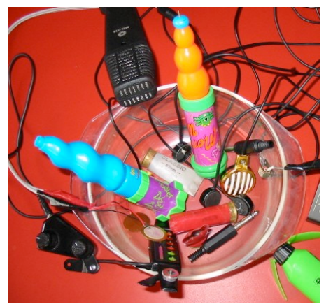
Figure 10. The Mixing Bowl.

bump up against piezo-elements and microphones of varied quality, or electro-magnetically interact with guitar pickups.