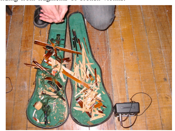
Figure 2. The splinters-on-a-string infra-violin .

Atonement for Violin Quartet (by John Bowers, first realisation at the Norwich Gallery, UK, 2004) is a combined installation-performance-webcast work which revisits the instrument destruction preoccupations of the Fluxus artists. Atonement specifically builds upon Nam June Paik's 1962 work One for Violin Solo. In One, a violin is slowly raised above the performer's head and then brought down suddenly upon a table-top. Atonement continues the action by rebuilding the broken violin and, indeed, over four days, repeats this ritual four times to create a quartet of refashioned instruments. The performance of a quartet composition completes the work. Atonement, in our terms, involves the transformation of violins into infra-violins. The broken bodies of the violins are difficult to use for good string tension. Other sonic possibilities have to be sought in the strings: lengthwise scrapings and low-tension thunks for instance. The broken shards present percussive opportunities with perhaps violin bows becoming beaters or scrapers. Figures 1 and 2 depict two different styles of infra-instrument building from fragments of broken violins.