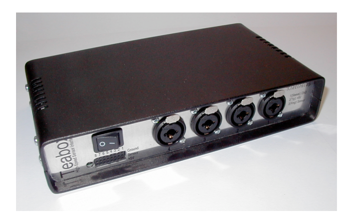
Figure 6. Teabox Chassis View

Another benefit is that any other data that is being input, such as video and especially audio, will have audio and gestural data synchronized to within 10 samples, without any jitter!