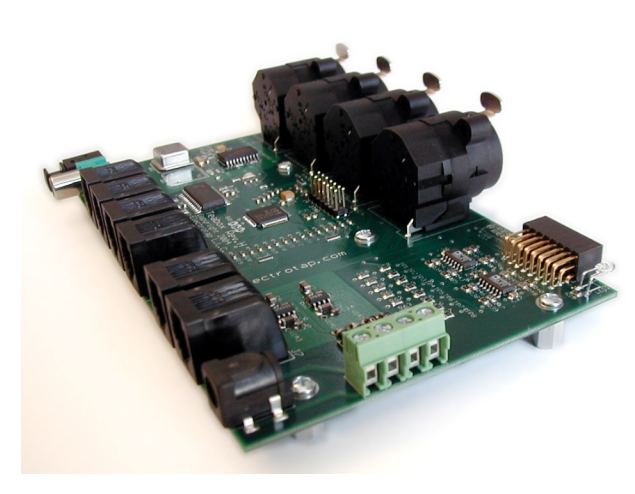
Figure 4. Teabox circuit board