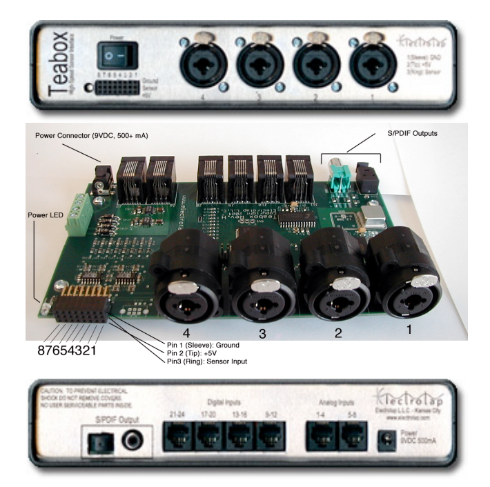
Figure 3. The Teabox Connections

Aside from the 8 continuous 12 bit sensor channels, there are 16 digital toggles that are accessible through 4 more RJ11 jacks.