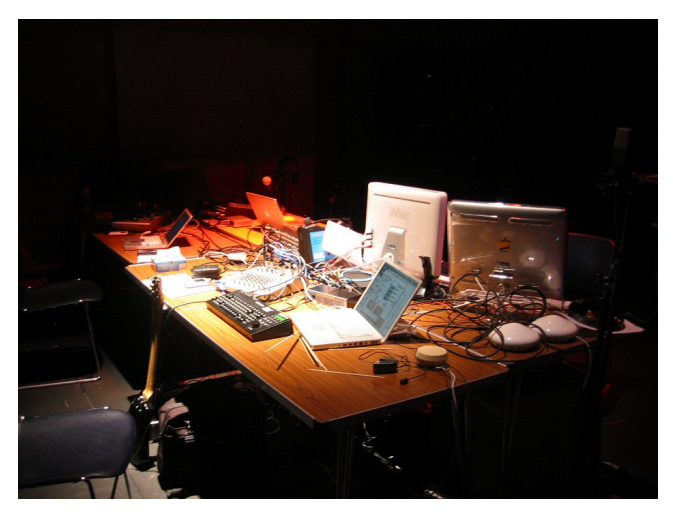
Figure 2: The BLISS Ensemble Setup