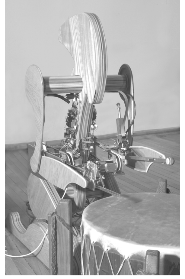
Figure 1: Haile - a perceptual robotic percussionist that listens and improvises with human drummers

effectiveness [40] led to the identification of a number of directions for further research. Based on the user responses, we are currently extending our previous perceptual, mechanical, and interaction research to melodic and harmonic music. Findings from the study regarding the mechanics of the robotic percussionist emphasized the importance of anthropomorphic design for the creation of familiar and inspiring interactions with humans both rhythmically and melodically. The study also emphasized the need for more sophisticated perceptual analysis, larger and more visual movements and richer acoustic variety. Another important aspects evaluated in the user study addressed the prospect of creating novel human-robot musical experiences that cannot be generated by humans. Here, users' responses suggested the need for more richer algorithmic response and new playing techniques that will inspire humans to play and think about music in novel manners.