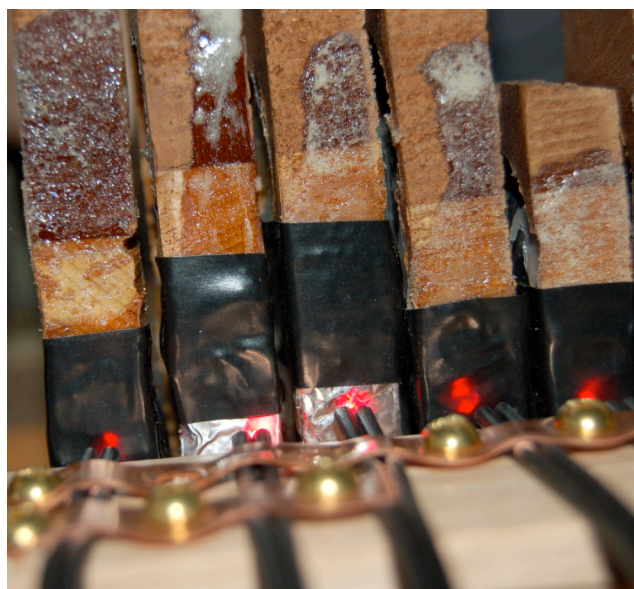
Figure 1. Optical sensing of piano key movement.

cable or circuit board. The other end of the fiber optic cable pair is secured to the base of the keyboard using a copper gasket and brass screws. The cable pair is aligned in front of a reflector that is attached to the far (capstan) end of the piano key in its depressed state. The reflector is withdrawn when the key is raised. Light emitted by the LED propagates down one fiber optic cable and is only reflected back down the other cable to the phototransistor when the key is depressed (see Figure 1). The phototransistor is biased to provide an output swing of several volts between ambient lighting and optical saturation. This large voltage swing provides overhead to ensure adequate signal-to-noise ratio even with shifts in ambient lighting, obviating the need for compensatory circuitry. The continuous nature of the analog optical sensor enables the measurement of key velocity with a single fiber optic cable pair for each key. As the key is depressed and the reflector moves into alignment, the amount of light reflected onto the sensor increases and the sensor’s output voltage increases. The time it takes for the sensor’s output to change between two different voltage thresholds can be measured and represents an average velocity over that duration. In this way, not only can note onset velocity be measured, but offset velocity as well (which is an oft-overlooked gestural parameter and lacking in many MIDI keyboards).