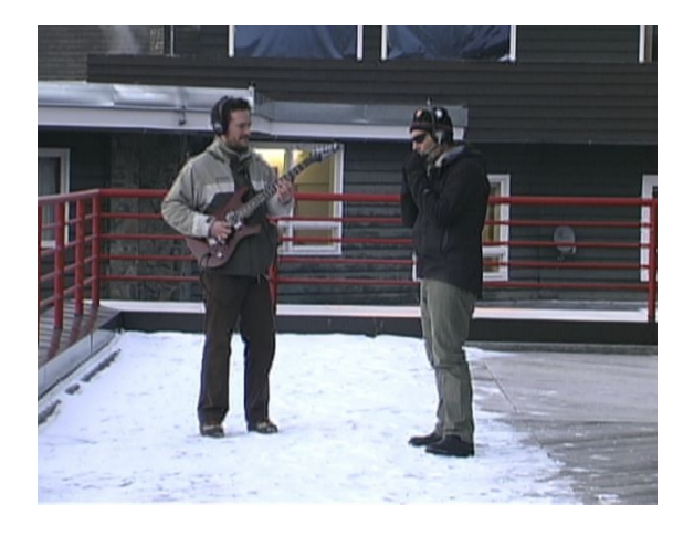
Figure 3: Two participants jamming in a virtual echo chamber, which has been arbitrarily placed on the balcony of a building at the Banff Centre.

Approaching mobile music applications from the perspective of virtual overlaid environments, allows novel paradigms of artistic practice to be realized. The virtualization of performer and audience movement allows for interaction with sound and audio processing in a spatial fashion that leads to new types of interfaces and thus, new musical experiences.