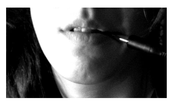
Fig. 4: the dancer with the audio-output cable in her mouth

signal-feedback was already applied and discussed in my earlier compositions and interface designs [9], [10]. It enables the dancer / performer to experience an alternative impression of the induced sound. Since it is electricity we are dealing with here, the dancer would feel a pain with waveform (sound amplitude) dependant intensity. Therefore, we need to be very careful with the amplification of the signal in order not to seriously harm the dancer.