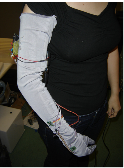
Figure 1. Wearing VAMP

Second, the glove is outfitted with an accelerometer attached to the top of the forearm. This accelerometer is aligned to detect acceleration along the axis that a conductor moves his or her arm when s/he conducts a downbeat. Finally, there is a small 1 lb. pressure sensor attached to the index finger of the glove. This sensor is approximately the size of a fingertip, with a thin, nonsensitive flexible extension that is sewn down the middle of the palm.