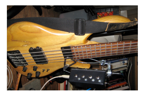
Figure 4: The control box mounted to an electric bass.

The control box was made to attach onto the bottom of the bass visually linking all of the sensors on the leg to the actual bass. The box placement was important for both aesthetic and functional reasons. Having the box in visual site attached to the bass creates the sense of augmenting. In the past, augmentation many times comes with the sensors all over the performance area of the instrument. This was more of a subtle solution to connecting the two worlds. It also serves as part of the controller with buttons for mode selects. This shortens the distance needed to travel to press a key and is smaller than a foot controller because of the form factor of the hands. The box is used in performance that same way any other tone control on your bass would be used only this controls both tone, texture and video.