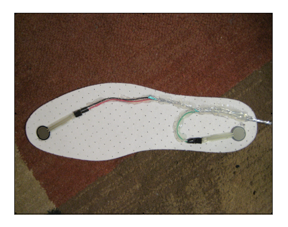
Figure 3: Foot controller using two FSR's.

The second part of the bass sleeve was the foot controller. The foot controller is made using two force sensing resistors, hot glue, wire cable, port and a shoe insole. The FSR wires are hot glued to the surface of the shoe insole. The hot glue is used to both insulate the wires from sweat and secure them to one place on the insole. The insole has a port to insert the FSR making the sensor easy to replace. The output from the FSR wires is a stereo 8<sup>th</sup> of an inch jack that can be extended to the control box using a stereo cable. After all the cabling was finished both the left and right insoles were glued together to create a buffer between the foot sensors and shoe.