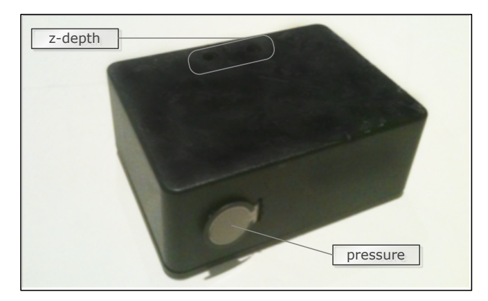
Figure 5: SmartFiducial Prototype (buttons 1 & 2 not pictured)