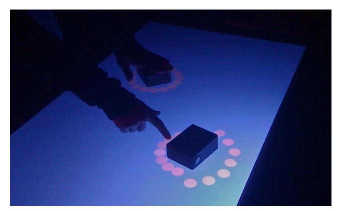
Figure 6: Two SmartFiducials being used with Turbine

In order to begin exploring the unique interactions afforded by the SmartFiducial, we have developed a basic wavetable synthesizer sequencer called Turbine (Figure 6). When a SmartFiducial is placed on the tabletop surface, sixteen "nodes" are created around the object. Each node represents a sixteenth note in a one-bar sequence, and dragging the node away from the SmartFiducial changes the pitch of the step. Using the z-depth sensing, the user is able to gesturally morph between the wavetables single-cycle waveforms, creating highly expressive, complex oscillations. Visual feedback is provided to the user via a soft Gaussian circle emitting from underneath the SmartFiducial. Currently the circle grows larger in size as the user nears the SmartFiducials proximity sensor, although the visual feedback may change as we continue to add more functionality to Turbine. In the future, we hope to expand Turbine's functionality, including the interaction between multiple SmartFiducials as well as regular fiducial objects acting as sound modifiers, effects, and other types of intermediaries.