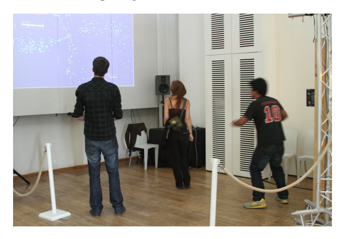
Figure 1: Picture of the installation with 3 participants.

Figure 1 gives a general overview of the installation setup: a 2D sound map is projected on a vertical wall, several participants or players move on the floor and their position is mapped to browsing cursors on the screened map. Figure 2 details the architecture: four speakers are located around the sensing zone to provide surround sound, participants are tracked using a depth sensor.