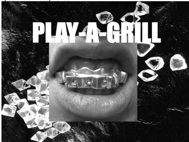
Figure 1. Play-A-Grill

Play-A-Grill, (see Figure 1) combines a digital music player with the mouth piece jewelry known as a grill, which is usually associated with hip hop and rap music genres. Grills are almost always made of precious metal, most notably gold or platinum. They are completely removable, and worn as a retainer. This piece of jewelry presents a perfect opportunity to merge an arbitrary music fashion object and reintroduce it as the music player itself. Because the grill is worn over the teeth, sound can be transmitted using bone conduction hearing instead of outside speakers or headphones.