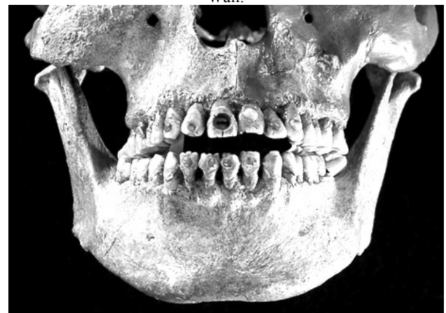
Figure 5. Bejeweled Ancient Teeth from Chiapas Mexico.

"Got 30 down at the bottom, 30 mo at the top All invisible set in little ice cube blocks If I could call it a drink, call it a smile on da rocks..."-Nelly. "I got my mouth lookin somethin like a disco ball I got da diamonds and da ice all hand set I might cause a cold front if I take a deep breath My teeth gleaming like I'm chewin on aluminum foil... Piece simply symbolize success I got da wrist wear and neck wear dats captivatin But it's my smile dats got these on-lookers spectatin My mouth piece simply certified a total package Open up my mouth and you see mo carrots than a salad My teeth are mind blowin givin everybody chillz Call me George Foreman cuz I'm sellin everybody grillz." -Paul Wall.