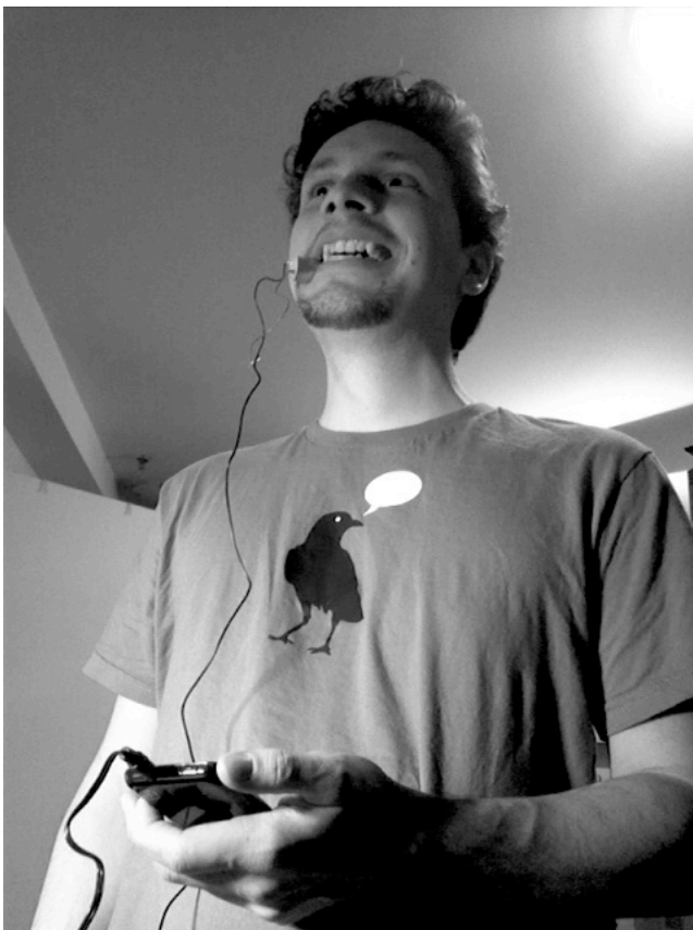
Figure 6. First Prototype Motor Output for Digital Player.