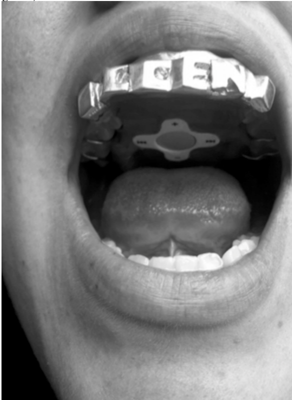
Figure 8. Functionality of Play-A-Grill.

mouth of a user. Second, it needed controls that were simple for a tongue to navigate. And third it had to be inexpensive, since it would be subject to dissection, and I would most likely use more than one. Indeed, I used two. The digital mp3 player I used was an off-brand mimicking an old version of the iPod Shuffle. This was a perfect device because it met the tactile controls for the tongue, the size requirements, and since it was an off-brand, it was inexpensive. The first step to hacking the player was to break the enclosure, detach the headphone input, and connect a motor. This was an easy hack and there was not much to it, until I found that the quality of the sound was too faint. To solve this problem I added an op amp break out board to amplify the vibrations of the motor. I connected the two motor leads to the amp and to the output of the device. During this operation, I soldered off the power connections on the circuit board and had to start fresh with a new mp3 player. Once the operation was repeated and successfully completed, I organized all the components and the grill together on the mouth mold and set them with a combination of silicones (see Figure 7).