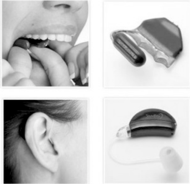
Figure 3. Functionality of SoundBite Hearing System

is placed inside the user's ear and transmits wirelessly to a unit inside the user's mouth, around the posterior molars (see Figure 3), where it translates the wireless signal back into vibrations on the teeth. This device is fairly new; it was recently approved by the FDA, and the earliest reviews are from 2010 [9]. Like the Baha, SoundBite aids single-sided and conductive hearing loss.