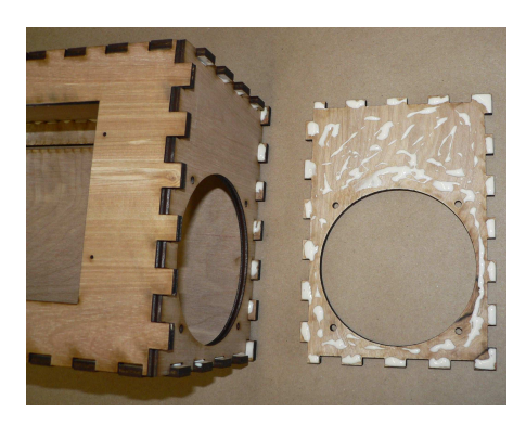
Figure 3: The thickness of faces containing loudspeaker drivers can be doubled simply by gluing two layers of laser-cut plywood together.

acoustic instruments have been fabricated and tested. The lessons learned are summarized here. The most significant challenge to making lightweight enclosures out of laser-cut wood is nonlinear rattling of the enclosure pieces or the electronic parts mounted to them. This occurs primarily due to structural resonances in the enclosure. The following steps can be taken to prevent rattle: