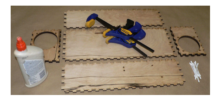
Figure 2: Preparations for gluing together pieces of laser-cut plywood to make an enclosure.

In order to make acoustic embedded instruments most accessible to the community, the authors have decided to pursue a digital fabrication approach for making enclosures. While the author looks forward to the possibility of employing 3D printing techniques for making enclosures, and while the lead author has a 3D printer at his institute, it has been decided to employ a 2D laser cutting technique for this work instead. One significant advantage of laser cutting is that the material is much less expensive, enabling students to engage more easily in creating acoustic embedded instruments in a classroom context. Also, it is hypothesized that musicians might have an affinity for laser-cut wood as final designs can moderately resemble some kinds of traditional acoustic musical instruments. Finally, wood glue is convenient to work with, is non-toxic, provides a strong bond, and is quite environmentally friendly. Figure 2 shows five faces of an enclosure laid out on a table in preparation for gluing them together.