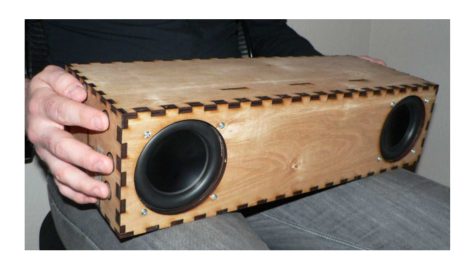
Figure 5: LapBox revision 3, with force-sensing resistors placed on the sides in the shape of the human hand.