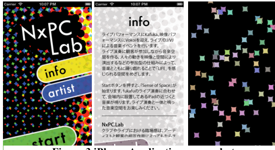
Figure 3 iPhone Application screenshots

The second performance was carried out on August 23rd, 2014 at NxPC.Live Vol.17 in Ogaki Japan, as an associated event for the Ogaki Mini Maker Faire. The underground parking was used as the venue. In this performance, all 16 sound IDs are assigned to iPhones so as to increase the flexibility of composing music. The scene of the performance is shown in figure 4.