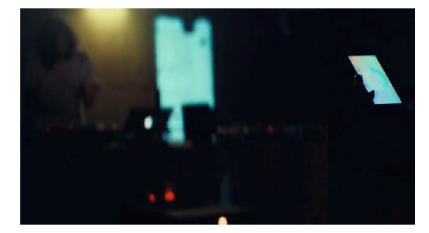
Figure 4 Scene of the Performance