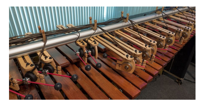
Figure 7: MalletOTon positioned above a marimba.

MalletOTon uses 48 rotary solenoid actuators. Such rotary solenoid actuators are the simplest type of robotic percussion end effector, and were chosen due to their ease of implementation. Attached to the shaft of the solenoid is a rubber-tipped mallet. Upon application of voltage to the solenoid, the mallet rotates into contact with the marimba's bar.