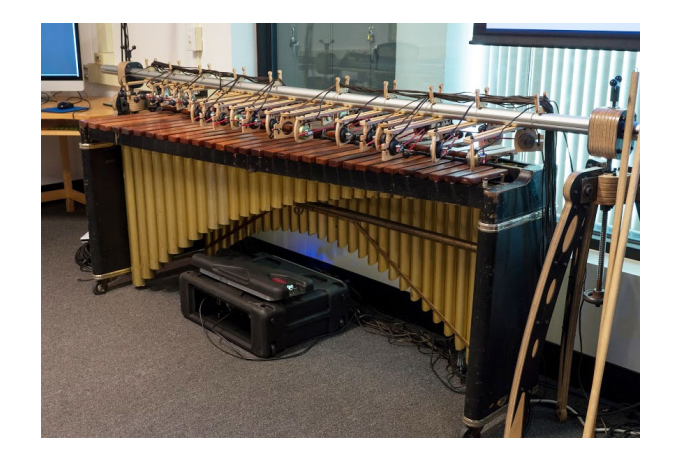
Figure 6: MalletOTon's actuator array positioned above a marimba. The actuators may be repositioned for use with other instruments.

One potential use case for modular robotics is exemplified by the Modulet system: a very simple, easy to configure array of actuators that may be deployed in a free-form manner in a space. A second Novalis use-case involves the use of modular musical robotic fixtures to augment an existing musical instrument.