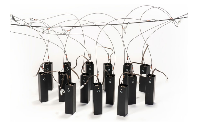
Figure 5: An array of Modulet units.

Up to 48 Modulet units may be connected and individ-