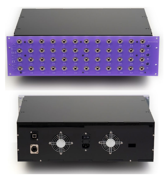
Figure 3: Novalis front and back views. Novalis contains 48 MOSFET drivers to control actuators.

Novalis, which serves as a hub for numerous actuators, is itself a modular device whose configuration as presented can be modified for different tasks. Currently, Novalis (shown in Figure 3) consists of a power supply, microcontroller, two actuator driver boards, and accompanying input and output interfaces. A block diagram of Novalis is shown in Figure 4