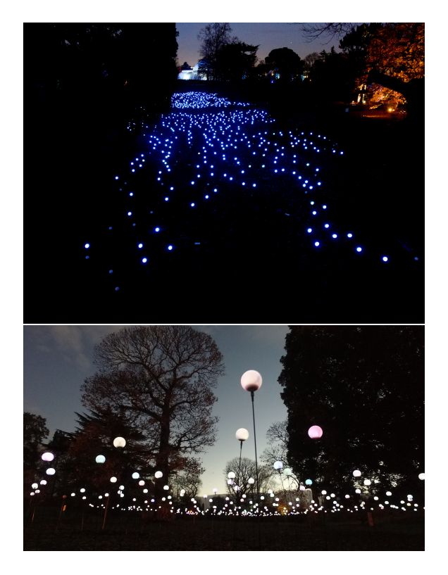
Figure 1: Bloom installed at Kew Gardens, London.

NIME'17, May 15-19, 2017, Aalborg University Copenhagen, Denmark.