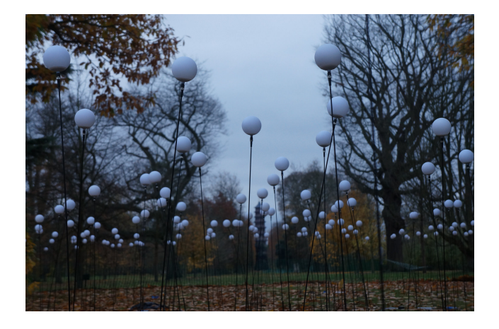
Figure 2: The devices and their cabling were required to be waterproof and durable, given the installation location and conditions and the 6-week installation period. The stands were manufactured from flexible plastic, and carried the DC 12V power supply that powers each device.

designing mappings [32] as well as methods for assessing their effectiveness [14].