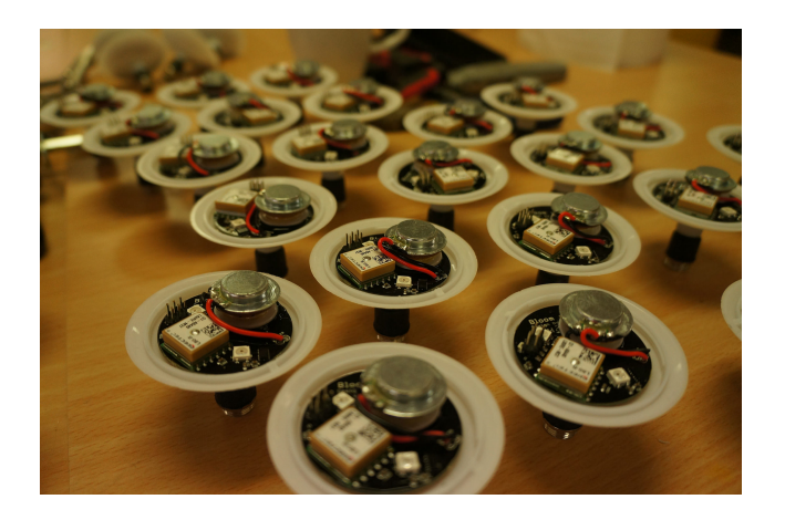
Figure 3: Diagram, and photograph of components of distributed pixel system with spherical enclosure covers removed. The GPS unit, the 2 NeoPixel LEDs and the audio transducer are clearly shown, while the Digistump Acorn unit was soldered to the underside of the circuitboard. Because of the size of the elements, the circuitboards were able to be mounted on the lower-most portion of the sphere, meaning that the rest of the sphere was not in shadow.

addition of fine temporal control of the amplifier gain. The audio transducer produced sound by transmitting vibrations to the circuitboard and through to the spherical cover, which was a more space efficient approach than trying to utilise a loudspeaker and associated mounting, and also neatly avoids shadowing. This is a highly unorthodox combination of synthesis (a digital tone generator combined with analogue amplifier with digital amplitude control), but for this context the limitations it provided still allowed for many design possibilities, which we discuss in section 3 below. Having fine-grained control over the audio amplitude allowed simple amplitude envelopes as well as longer-term ramping effects, meaning tones that are sometimes annoying when they are constant, could be modulated both over the duration of a note (100-1000 ms) and over the term of a crescendo or phrase (10-60 s).