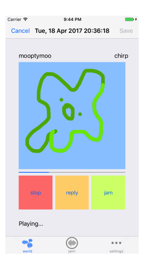
Figure 3: The MicroJam recording screen; 5-second long performances encourage a fast cycle of recording, listening, and replies.

MicroJam is intended to be used as a research tool to examine the potential for ensemble performance in everyday