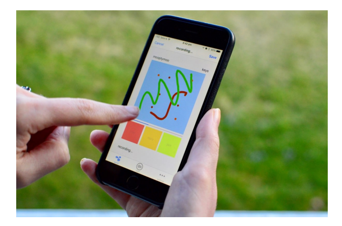
Figure 1: MicroJam is an app for recording and sharing very short touch-screen performances.

prototype<sup>1</sup>. We aim to explore possibilities for ensemble interaction in a mobile music DMI and the creative space of tiny touch-screen musical performances.