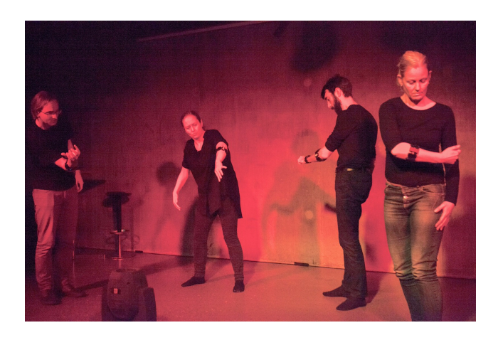
Figure 2: The premiere of Stillness Under Tension. Each performer could use their arm muscles to activate different oscillators, while their arm direction selected a different timbre and base frequency.

The performers were able to activate different oscillators by tensing the muscles in their arm while standing still. This required significant focus to accomplish without moving. As each performer had a different arm position, the