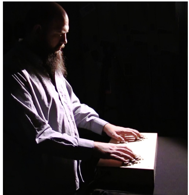
Figure 2: A person feeling ten channels of vibrotactile stimuli from the SDVAA.