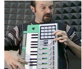
Figure 5 The VOMID Figure 6 VOMID in performance.