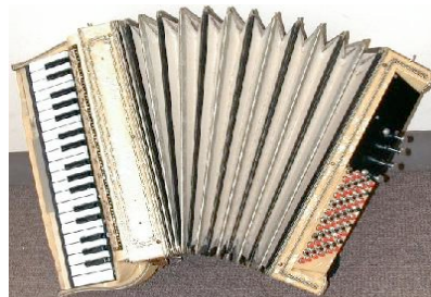
Figure 1. SqueezeVox Lisa.

Similar to Lisa, concertina Maggie’s left side has buttons (32 plus “bank-switch”) and bend sensors (Fig. 2 upper). However, Maggie differs much from her larger SqueezeVox siblings. The right hand provides pitch control via four buttons functioning as brass instrument transposition valves, and a thumb slider (Fig. 2 lower) selecting the overtone/octave. Maggie has no internal speakers, and made her performance debut at Seattle NIME 2001 in the Experience Music Project Museum JBL Theater, performing “7 Minutes from Tibet,” controlling multiple models of Tibetan chant, Tuvan overtone singing, and banded-waveguide Tibetan prayer bowls.