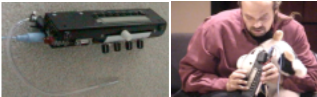
Figure 3. The COWE controller. Figure 4. COWE with cow.

Continuous blowing into the breath-sensor became tiring, so a large stuffed toy cow was called into service, reinforcing the COWE name. The cow was re-stuffed with an exercise ball, which when inflated acts as an air reservoir. Inserting the breath pressure hose into the ball's inflating nozzle turns the COWE into a bagpipe-like interface, allowing the user to squeeze the cow under the arm to control breath pressure (Figure 4). The COWE has performed in a variety of venues, including the Princeton Listening in the Sound Kitchen Festival in 2003, and the Cornell Music Festival in 2004.