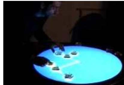
Figure 2: One of the test subjects playing with the objects.

There was a difference between the subjects in their initial attitude toward the interface. The reactable expert (RE) was, as expected, trying out the objects systematically and quickly experiencing the limitations that differentiates these from the regular reactable setup. The DJ, on the other hand, tried to find how the connection between his scratching techniques and these experimental objects could be made, and experienced that it was not very easy to scratch with models. In general, their attitudes changed over time. The RE became more positive about the interaction with the objects, while the DJ became more pessimistic, especially towards the control of the models.