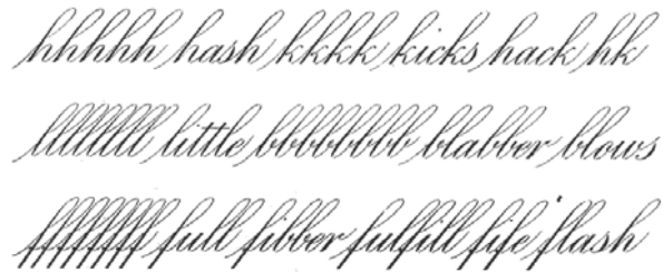
Figure 3: An exercise based on Engraver Script by Willis A. Baird ( http://www.zanerian.com/BairdLessons.html )

the method in Pd 6 , to be compatible with the largest number of possible users.) Incoming tablet data is mapped using an Open Sound Control [28] wrapper, which is part of the CNMAT Max/MSP/Jitter Depot. [30]