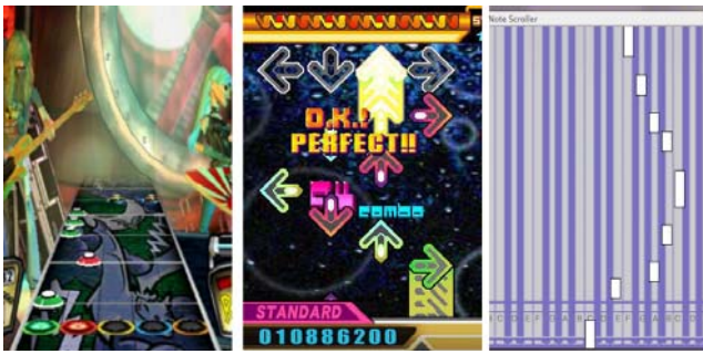
Figure 2: From left to right: The interface for Guitar Hero , Dance Dance Revolution and Note Scroller

display over static music sheets is that the user doesn't have to change their point of focus as the required information moves itself to where the user's gaze already is.