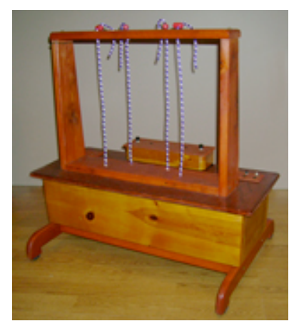
Figure 3. The VideoLyre.

The VideoLyre consists of a pine and cherry box on legs with a frame above to hold strings that stretch down into the body. The strings are connected inside the box to flexible stretch sensors through which a small voltage is sent from and back to a MIDItron<sup>®</sup>. Pulling the strings stretches the sensors, causing a drop in voltage, which is mapped to video effect level. Buttons on the top of the box are used to select effects and adjustment parameters.