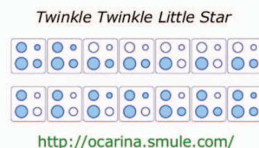
Figure 6. An example of Smule’s Ocarina tablature: the beginning of Twinkle, Twinkle, Little Star.

In addition to the experience on the mobile device, Smule’s Ocarina has a web portal [14] dedicated for users to generate and share musical scores. Since November 2008, users of the Ocarina have authored more than 1200 scores using our custom Ocarina tablature (Figure 6), serving millions of views. User-generated scores include video game music (e.g., Legend of Zelda Theme Song , Super Mario Bros. Theme ), western classical melodies (e.g., Ode to Joy , Blue Danube , Adagio for Strings ), to rock classics (e.g., Yesterday by the Beatles, Final Countdown by Europe), to show tunes, holiday music, and more.