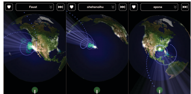
Figure 5. Screenshots of in the World Listener , rendering snippets from actual users. Ocarina now has more than one million users worldwide.

The anonymity of the social interaction is also worthy of note – everyone is only identified via a self-chosen handle (e.g., Link42), their GPS location, and through his/her music. And yet, according to overwhelming user feedback, this seems to be compelling in and of itself.