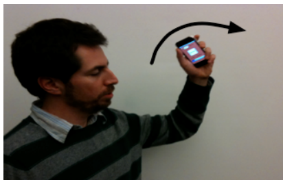
Figure 2: Throwing a sound

Notice that this metaphor makes us think of a sound not as the result of some process, but as a distinct object, separate from other sounds, amenable to manipulation, and able to be transferred from one person to another. Blackwell points out that a metaphor frames not just the interaction between a user and the computer, but also how the designer sees the user. The metaphor of a sound as a ball frames the performer as someone playing with a ball. When more than one player is present this leads naturally to the interaction of passing a sound from one performer to another. Thus we added to the possible interactions the ability to take aim at another performer and throw a sound to them.