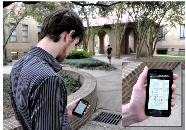
Figure 1: The AuRal environment being used by 2 musical agents at the LSU Quad. Map view in inset.

This approach can be viewed in three ways; as a distributed musical instrument, whereby individual parameters are distributed to performers within a region; as a shared sonic environment where agents are able to enter and influence the sound of the overlaid sonic environment; or as a piece of music into which and out of which a participant can physically move.