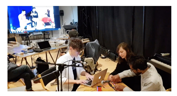
Figure 1: Team B performing with the Percampler (view from Oslo).