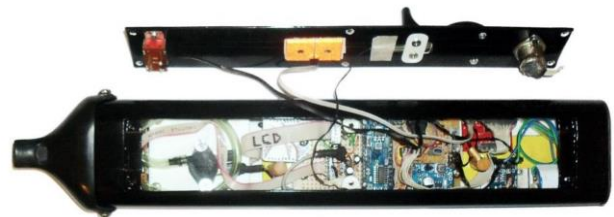
Figure 6. Opened instrument housing and internal elements.

In order to provide an ergonomic housing for the instrument, a 5 cm diameter and 30 cm long PVC pipe has been used, due to its low cost and wide availability. Then, it was heat collapsed so that its section acquired the approximate shape of an oval rectangle of 6 x 3 cm, with two parallel flat faces. This provides a smooth feeling to the touch, without any edges that could interfere with the grip or comfort of the hands. Figure 6 shows the housing with the internal elements in place.