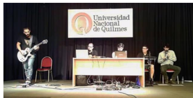
Figure 7. ElectropUNQ Ensemble during the concert. Eolos being played on the rightmost.

The event was conceived as a first step towards a new stage of collaborative music and digital transmission in Latin America, being the first of its kind, not only between the institutions, but also between the countries. Figure 7 shows the ElectropUNQ Ensemble with Eolos (first from the right).