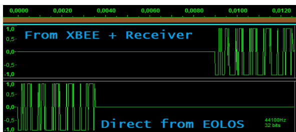
Figure 5. Receiver's latency measurement. A 9 ms difference is observed between both signals.

The wireless range was tested to work well at least 10 m indoors, which meets the needs of the instrument. The added latency was (preliminarily) measured to be about 9 ms. This measurement (Figure 5) was done using an audio interface, recording simultaneously the MIDI electric signals from both the receiver (left channel) and Eolos' embedded DIN output (right channel). Then, the time difference between the signal edges was calculated to obtain the total latency.