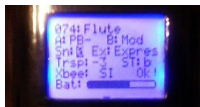
Figure 4. Detail of the LCD screen (with backlight on).

Since it is necessary for the user to visualize and customize the status of some parameters, a monochrome LCD screen (see Figure 4) has been incorporated into the instrument. This screen has a resolution of 84x48 pixels and LED backlighting that can be deactivated when not required.