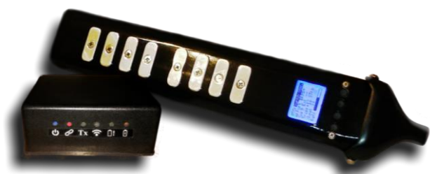
Figure 1. Eolos and its wireless MIDI receiver.

The purpose of this paper is to present central aspects of Eolos (shown in Figure 1), an open design wireless MIDI wind controller. The criteria that guided its design were: to present an interface that facilitates the production of music to any person, regardless of their playing skills or previous musical knowledge; to offer a wireless operation, for the convenience of the player; and to maintain a low building cost. Through its expressive response, sound possibilities and independence of the use of cables, it was sought to allow its integration in diverse music ensembles [7].