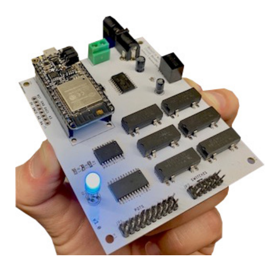
Figure 1: The Bendit_I/O board.

NIME'19, June 3-6, 2019, Federal University of Rio Grande do Sul, Porto Alegre, Brazil.