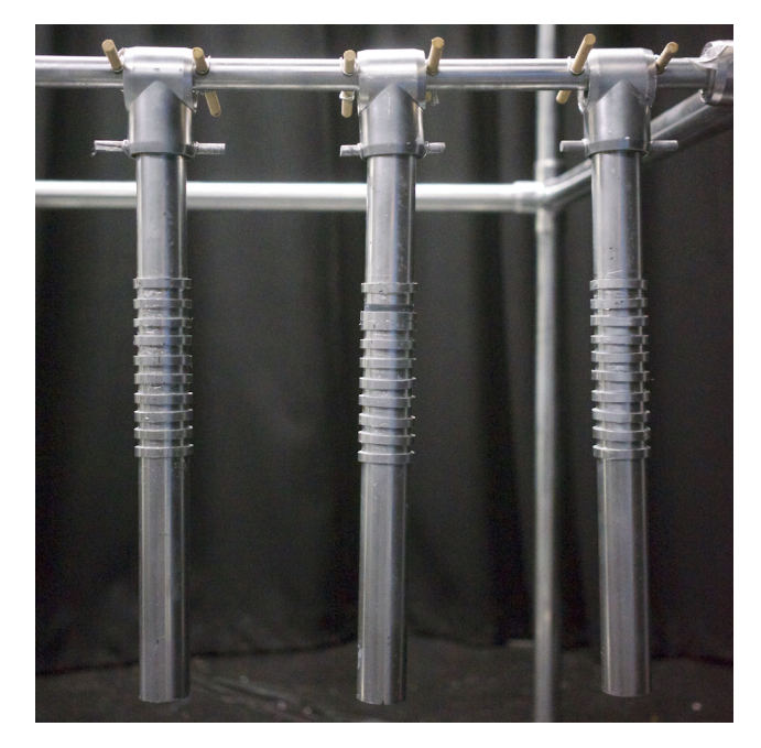
Figure 3: Close-up of pendulums, 50 centimetres long, with ten raised rings at one centimetre spacing.

The instrument is two metres wide and two metres high. It is constructed from PVC pipes and PVC pipe connectors. It features 20 identical pendulums. Each pendulum