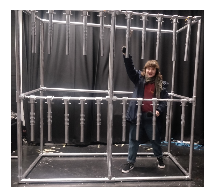
Figure 4: Three participants performed all tasks from inside the frame even though this restricted access to the other side of the instrument.

When imagining the DMI's sound, nine of the ten participants were influenced by the instrument's materiality such as the pendulum rings that brought to mind güiro-inspired sounds and the metallic aesthetic that evoked sounds and tonal layouts of metallic instruments. These results reinforce Pigrem et al.'s findings that performers' expectations