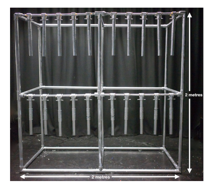
Figure 1: The study instrument is 2 metres high, 2 metres wide and features 20 performable pendulums that create 20 discrete tones.