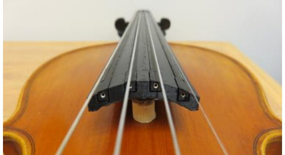
Figure 3. Front view of the end of the fingerboard without the Arduino and FSRs.

printed violins have addressed this problem with support rods.<sup>2</sup> However, the slots for the conductive strips leave very little room to include a support rod. Therefore, we worked with a luthier who placed a thin, flat piece of ebony onto the neck of the violin to support the PLA surface. After a few weeks, while the fingerboard continued to support the weight of the finger pressure, we found the natural placement of the fingerboard started to sag. In response, the luthier also placed a small piece of wood underneath the fingerboard to prop it up into the correct position (see Figures 2 and 3). A copy of the fingerboard was made from PETG filament. It was not noticeably stronger than the PLA version. Aesthetically, the PLA version is preferred because it is not as shiny as the PETG.