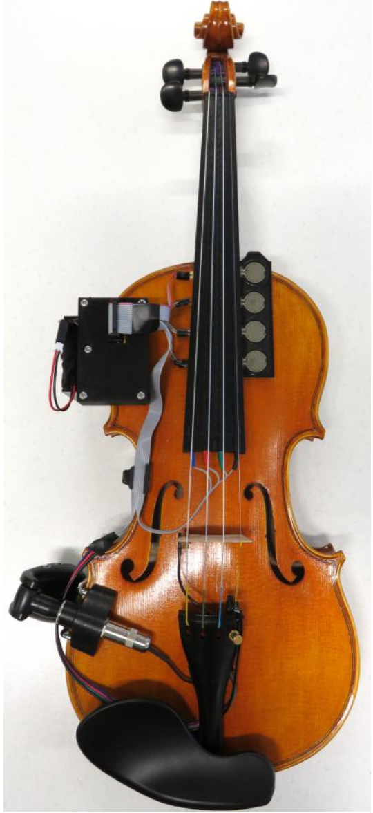
Figure 1. TRAVIS II with electronics setup.

cover the areas on the fingerboard below high second position; to sense in all positions, the nut and therefore the string height would need to be raised to prevent SoftPots from contacting the vibrating strings. Also, the player can only use the SoftPots on the G and E strings; there is no sensing on the D and A strings. Furthermore, the aesthetic of TRAVIS I makes it difficult to use in traditional contexts. Its SoftPots and wiring are permanently attached and cannot be removed from the violin when stored in its case. Finally, TRAVIS I has only two FSRs to trigger presets, which limits its compositional potential.