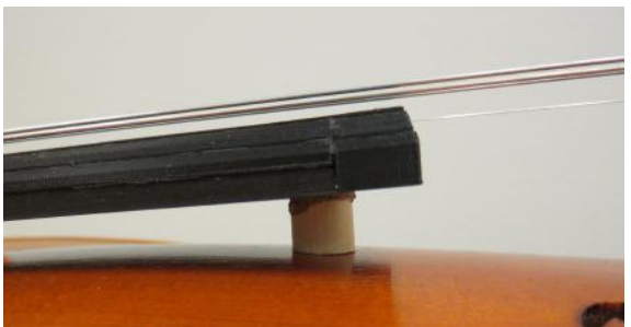
Figure 2. Side view of the end of the fingerboard and support.