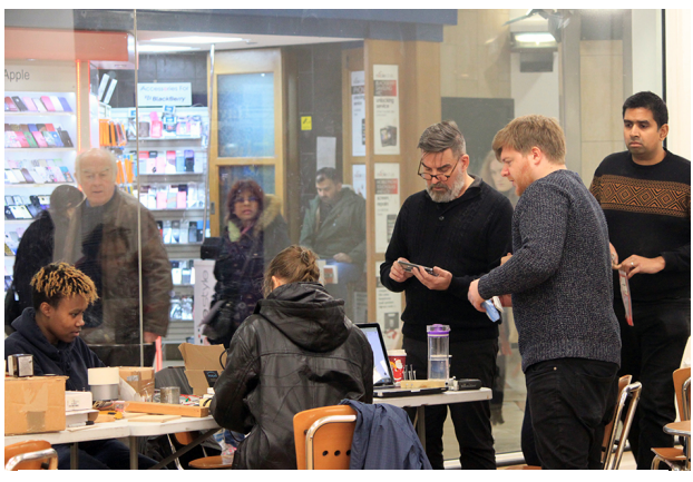
Figure 3. Making in Public