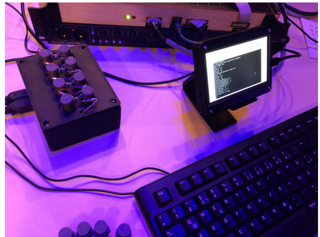
Figure 2: Setting up the PhyBox for musical composition.

Music is fed into the PhyBox through the MIDI protocol. MIDI data is broken down into four parameters — pitch, velocity, time between note-ons (rhythm), and dura-