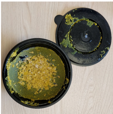
Figure 1: Physarum polycephalum culture grown in a lunch box.

We maintain a Physarum polycephalum farm [1] grown in plastic lunch boxes as shown in figure 1. In order to grow Physarum polycephalum -based memristors and make them a part of the composition process, we transfer a section of the organism into receptacles [5]. These receptacles allow the organism to act as an electrical component and are operated through the PhyBox [6], a portable kernel for creative applications as shown in figure 2. PhyBox is powered by a Raspberry Pi model B.